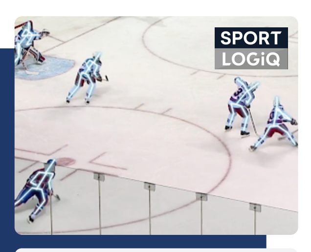
Above: Sportlogiq's analytics tool allows individual hockey players to be tracked and analyzed

How do you save coaches hours upon hours of time spent watching game footage to improve their athletes' performances? For media companies, is there a way to report game highlights and analyses faster? Enter Sportlogiq, a Montreal, Canada-based provider of modern sports intelligence through AI. The company uses machine learning models to track hockey, soccer, football, basketball, and figure skating events like goal scoring, passes, missed shots, and blocked shots, as well as metrics like ball location, player time on field, player position, and more. Sportlogiq technology can report nearly every detail of a broadcast game, with no human supervision and no time lost in playback.